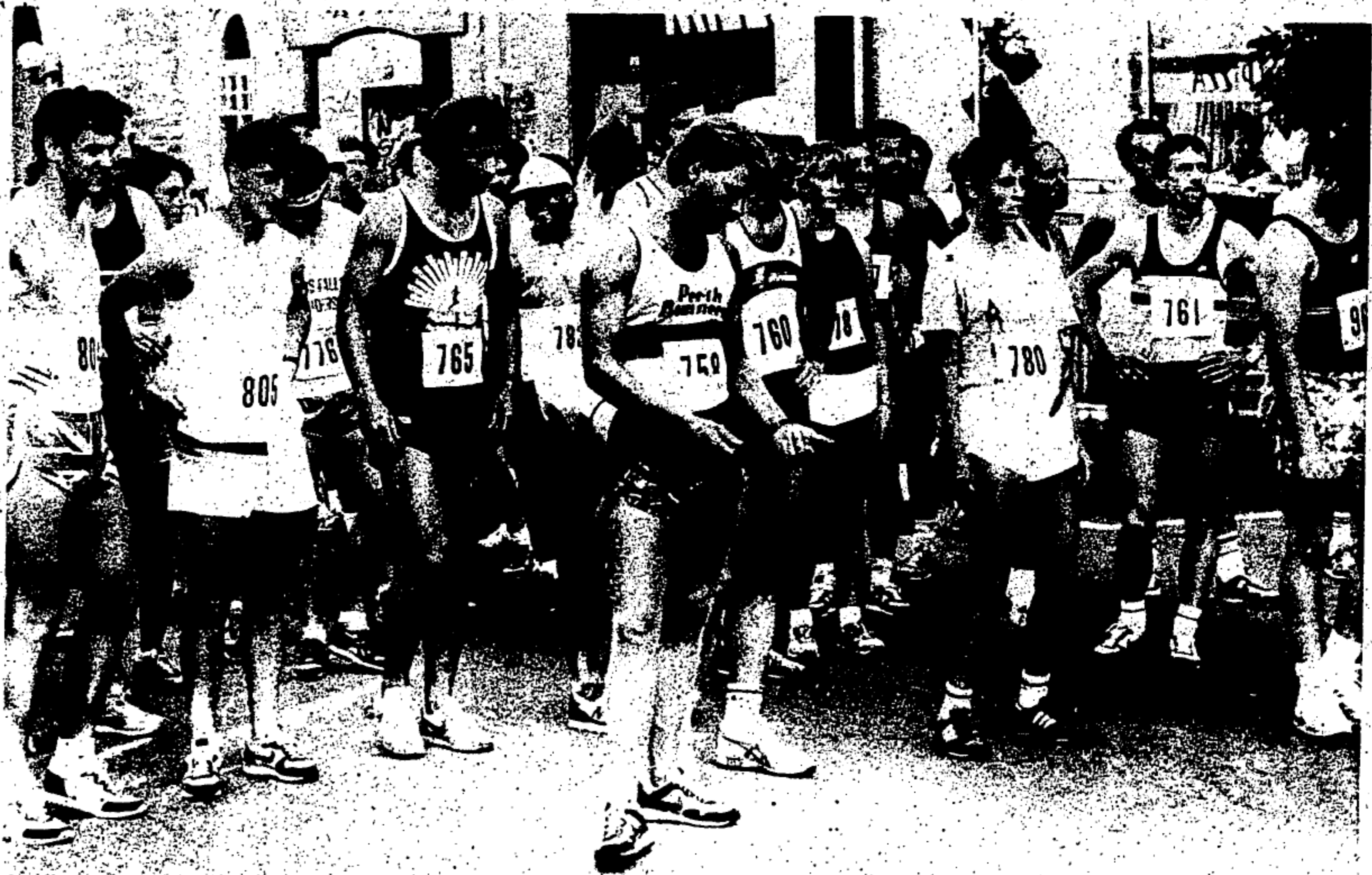
Nearly 70 runners participated in the historic Glen Tay Block Race on Thursday. Runners above listen to starter's orders as they prepare for the 14.7 km event which first took place in the early 1900's.