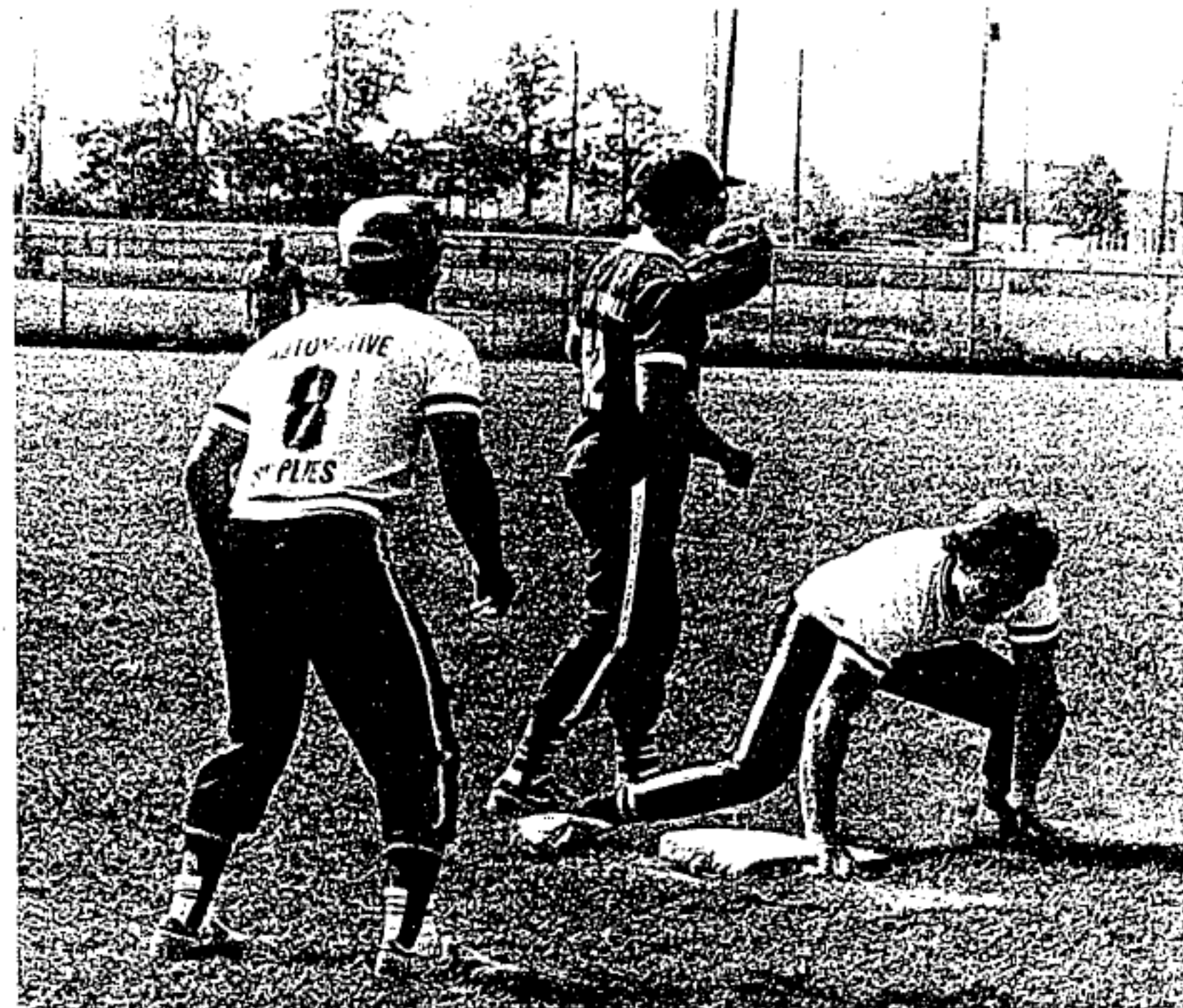
Although 40 teams from all over Ontario converged in Perth over the weekend to take part in a massive tournament, district teams proved to be the champs, in both competitive and recreational division contests. Three Smiths Falls teams, and the Carl's Side Road team from Lanark won the honors.