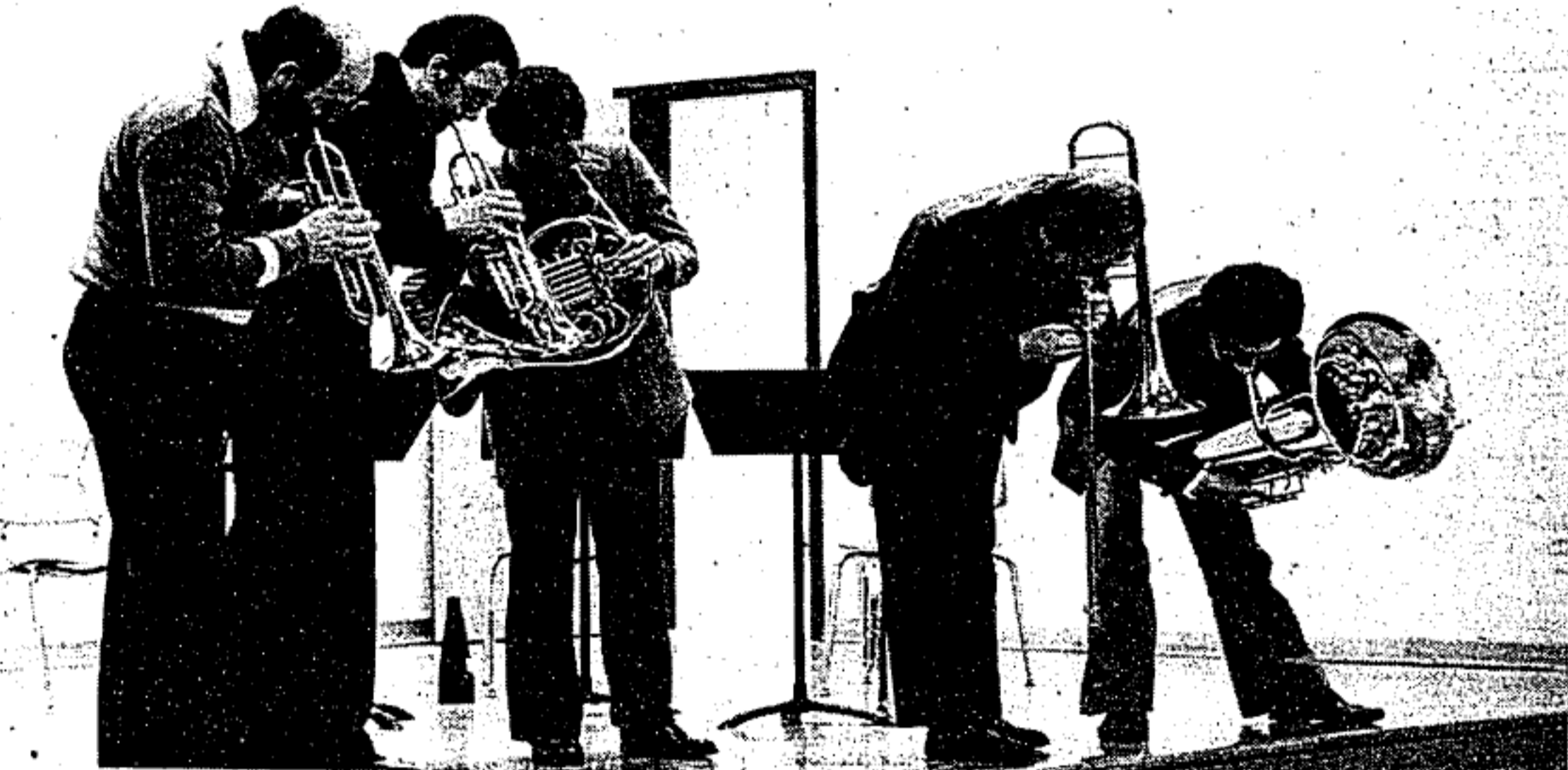
Canadian Brass performing at Maple Grove School