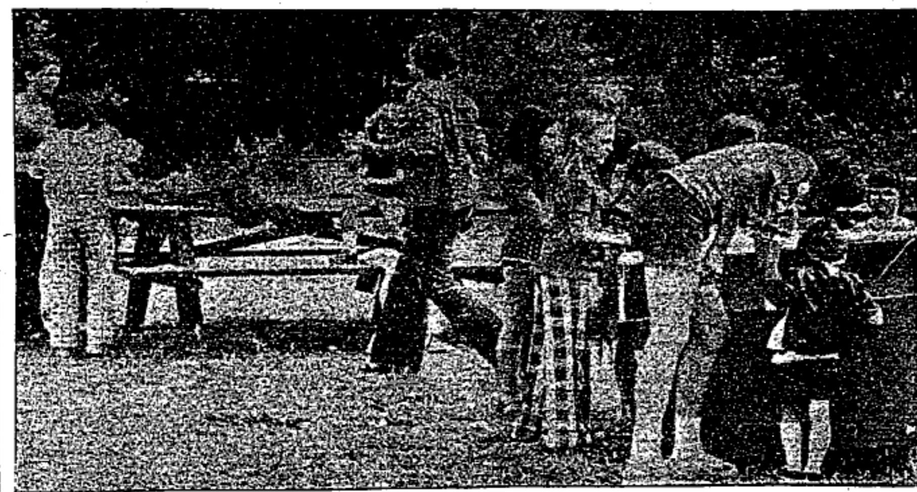
EXPERIENCE '73 sponsored by the Province is providing work for six students in town and providing daytime activities for up to 75 young-

sters. The activities include arts and crafts, various sports at the Last Duel Park site and afternoon swimming at the pool.